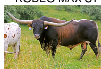
RODEO MAX ST