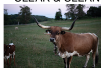
CLEAR & CLEAN