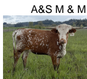
A&S M & M

TTT: 60.5000 on 02/03/2024 Composite: 43.0000 on 12/30/2022