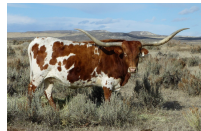
Venus Queen of Halloween