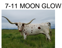
7-11 MOON GLOW