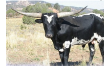
Hunts Demands Respect